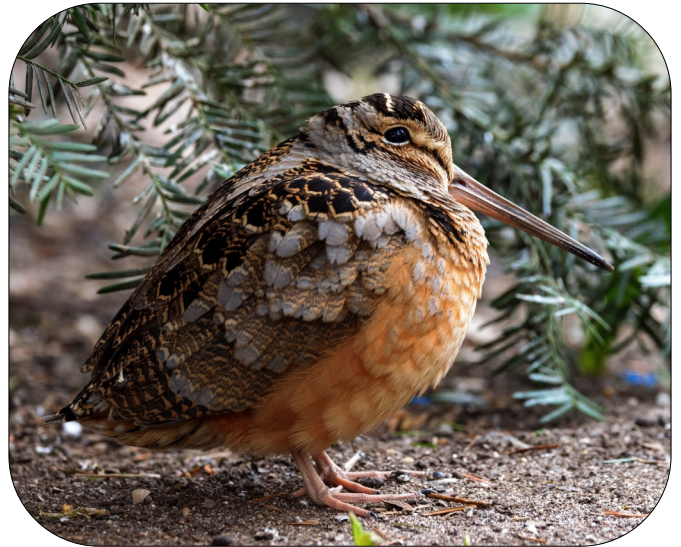
American Woodcock, Bryant Park, New York, New York

We had a great amount of help at our April work day and did a number of things including working on the tractor, putting up two new nest boxes that were made by one of our members, pulling a drainage hose, and pulling seven large bags of garlic mustard. Our next work day is the Saturday before Memorial Day. If you are interested in helping out at the Sanctuary at any time reach out to sanctuary@sbeaudubon.org .