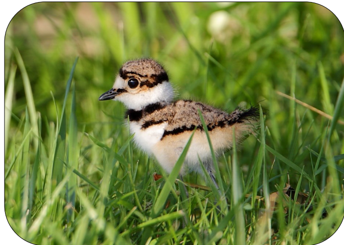
Killdeer chick.

When in doubt, your best course of action is to contact a wildlife rehabilitator. The Humane Society of the United States has a website that lists wildlife rehabilitators by state. In North America, the Migratory Bird Treaty Act prohibits handling or possessing most wild birds without a federal permit, so do not keep or attempt to raise any wild birds that you find. Learn more about the best way to respond to a baby bird on the Cornell Lab's NestWatch website.